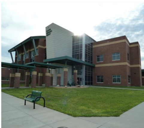
Cooper Memorial Library